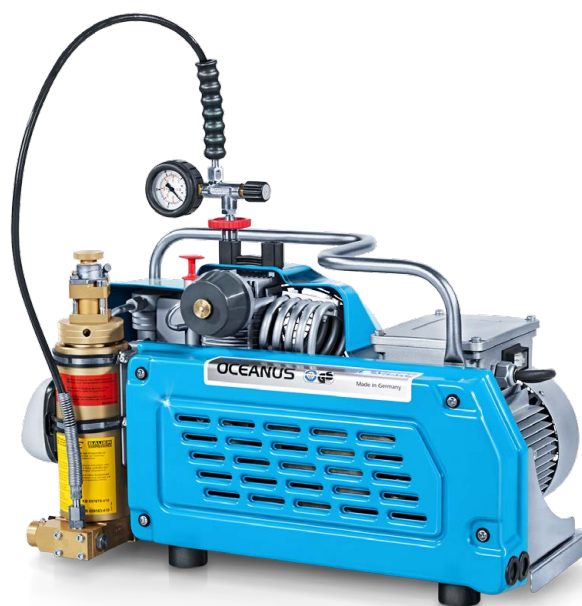
OCEANUS seen from rear with 300 bar filling hose